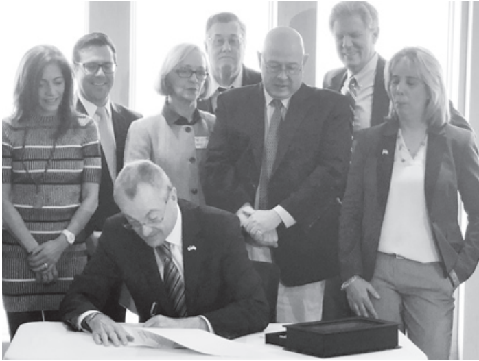
Senator Bob-Smith along with First Lady Tammy Murphy, Congressman Frank Pallone and environmental leaders look on as Governor Murphy signs Executive Order 7 on January 29, 2018

It is clear that we have to take urgent action to help protect against the environmental effects of climate change. As a coastal state, New Jersey is extremely vulnerable to the potential for harm caused by sea level rise and increasingly larger-scale and more violent storms. It is clear that states will have to lead the way in protecting against climate change. Unfortunately, we have lost precious time in New Jersey under the Christie administration to implement needed protections, but we are committed to taking action under the Murphy administration. It was my honor to be with Governor Murphy as he signed Executive Order No. 7 mandating that New Jersey begin the process of reentering the state into the Regional Greenhouse Gas Initiative (RGGI).